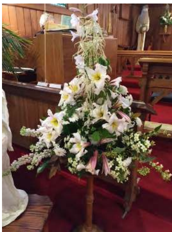
Christmas Eve flowers