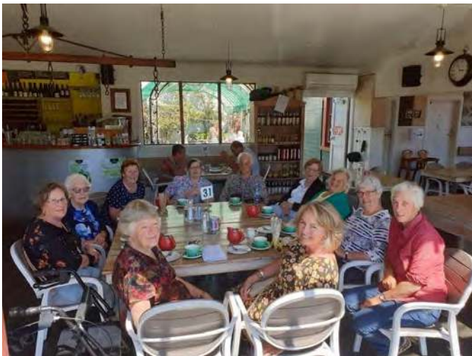
February Fellowship meeting at Le Telephonique