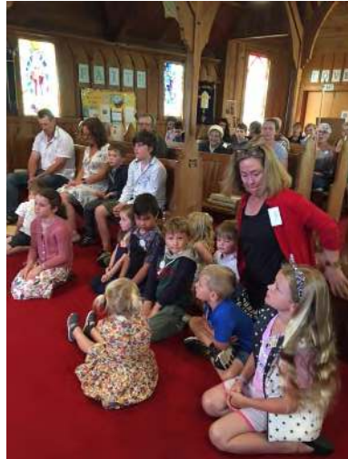
20 Dec - Children's Service