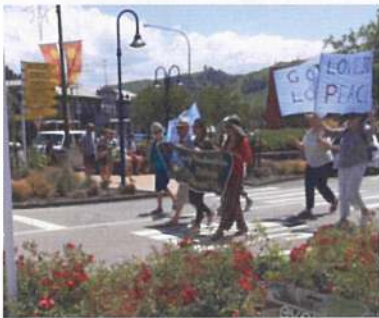
Combined Churches Christmas Parade