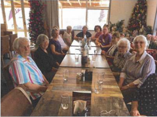
Fellowship Group at Waiouru Rustic café December 12th