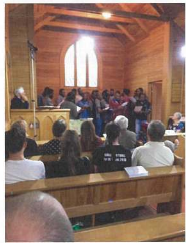
Carol Service at Kawhatau 15 December