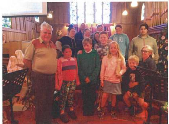
Children's Service with Waimarino Band Christmas 22 December 2019