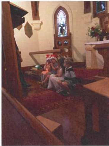
Carol Service at Moawhango 23rd December