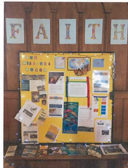
Our winning Missions Board